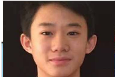
Home: Short Hills, NJ • Rating: 2356