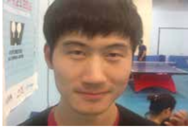
Home: Fresh Meadows, NJ • Rating: 2603