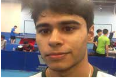
Home: Chappaqua, NY • Rating: 2327