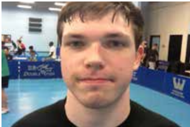
Home: Newark, NJ • Rating: 2270