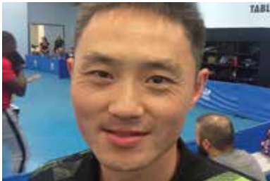
Home: Jericho, NY • Rating: 2540