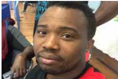
Home: Lagos, Nigeria • Rating: 2322