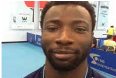
Home: East Orange, NJ • Rating: 2414